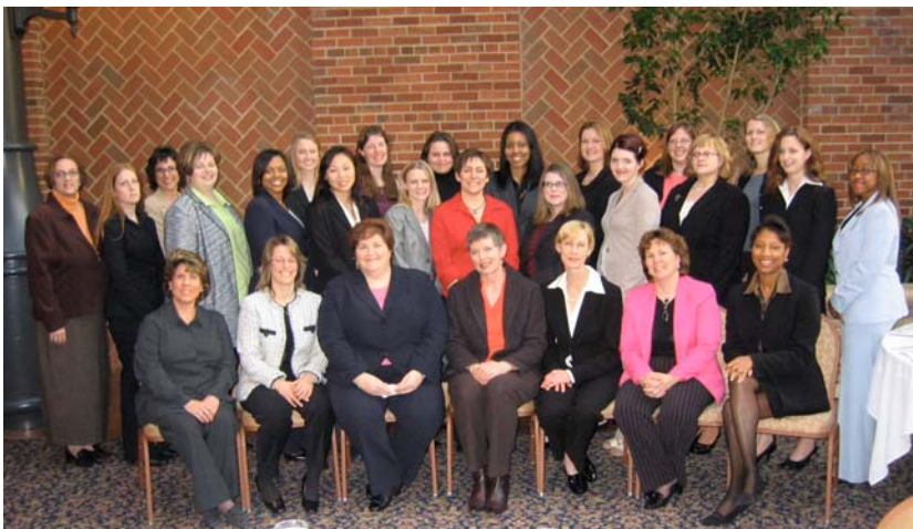
2006 Outstanding Women Law Students & WLAMF Board of Directors